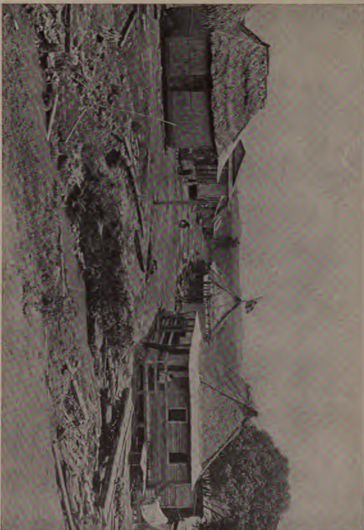
A Panamanian Village